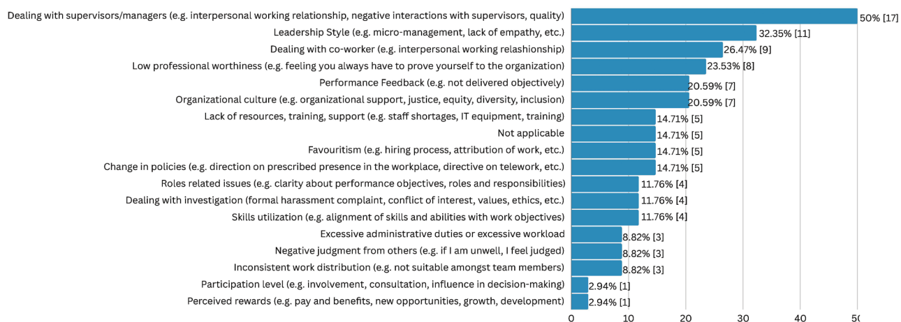
FIGURE 1 Organizational stressors in participant consultations with ombud’s office. Labels are positioned adjacent to each column, indicating the organizational stressors for which participants sought consultation from the ombud’s office. Percentages (%) are provided next to each column, derived from participant responses. The numbers in square brackets [ ] alongside each column represent the specific count of responses within each category. IT = information technology.

In the examination of operational stressors, participants detailed the challenges leading them to seek consultation from the ombud’s office, as depicted in Figure 2. Among the 34 participants, 3.33% reported consulting on social life